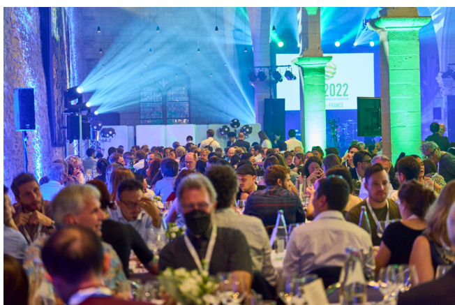
› Gala dinner at Grenier Saint Jean.