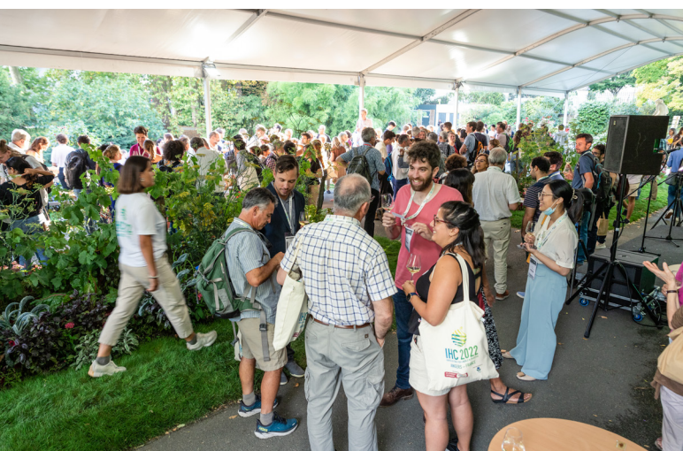
➤ Chenin wine tasting.