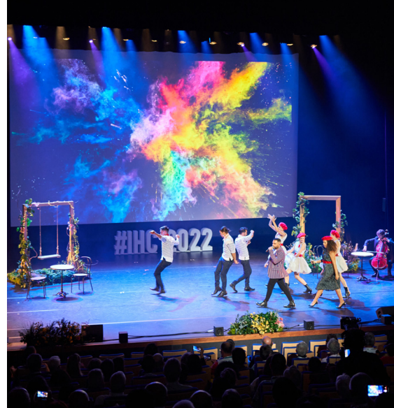
► Show at the opening ceremony.