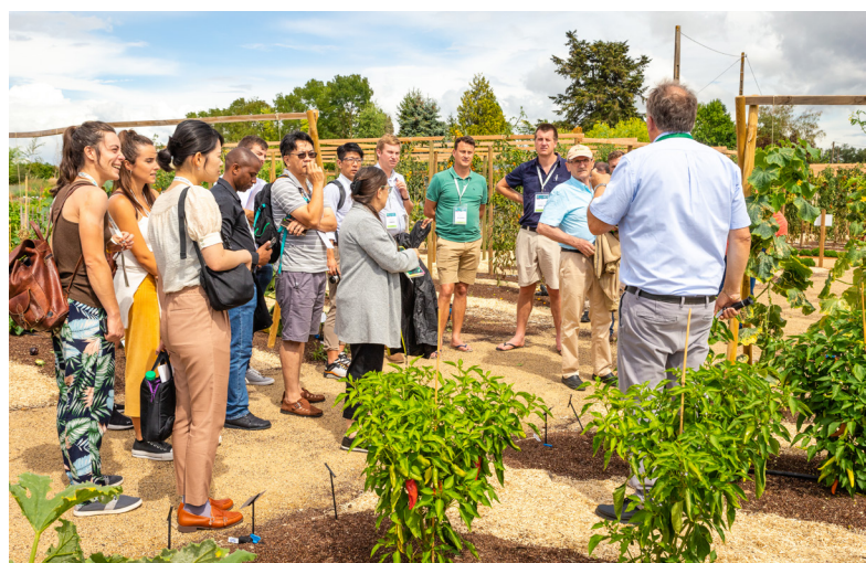
➤ Technical tour at Graines Voltz company.