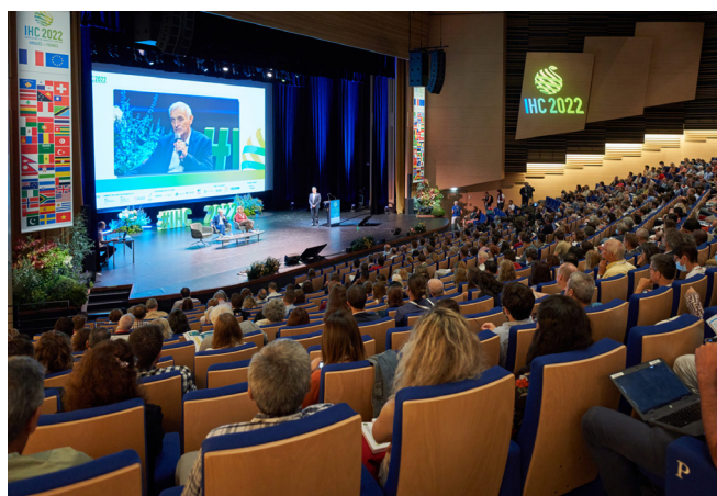
➤ A full amphitheater for one of the plenary sessions.