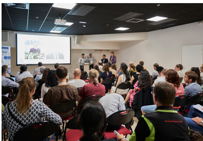
➤ Full attendance at Workshop 5.