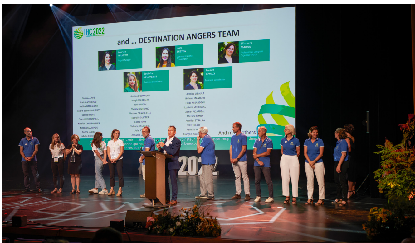
> The IHC2022 organizing committee on the stage at the welcome ceremony.