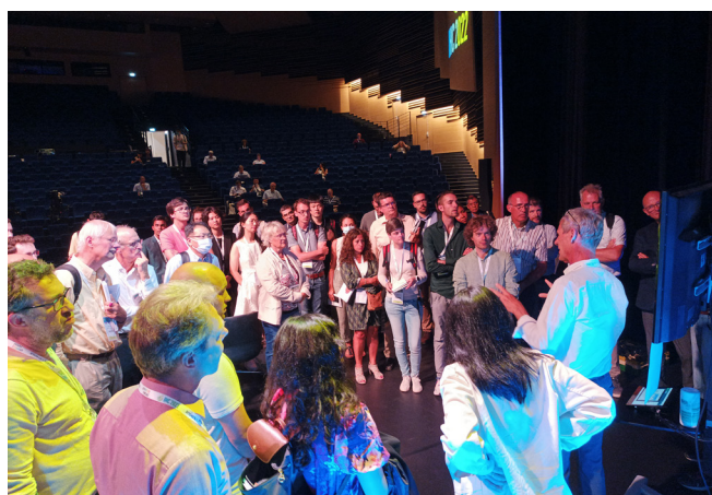
➤ e-poster session.