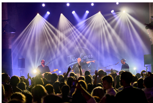
› The “Trio Cover” band set the mood at the Gala dinner!